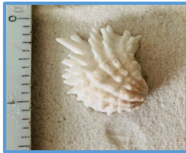
L - Spiny Jewel Box