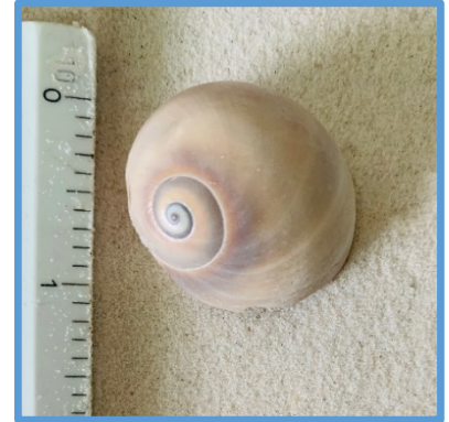
O - Shark's Eye