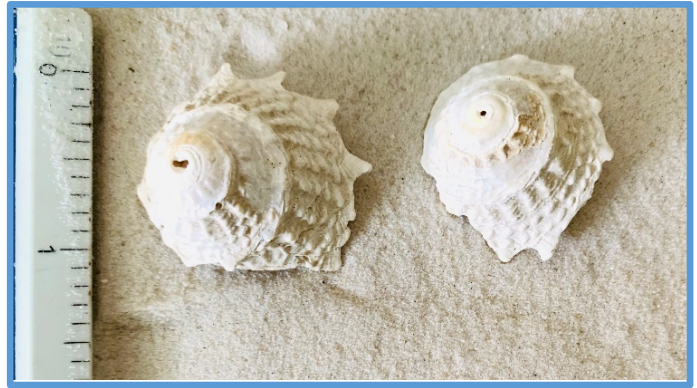
K - Long Spined Star