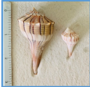
M - Whelk