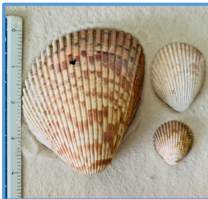
H - Cockle