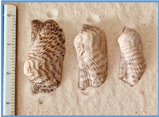
J - Turkey Wing