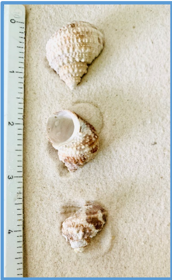
D - Turban