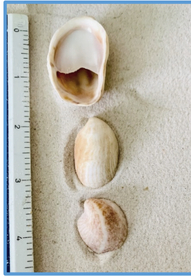
B - Slipper