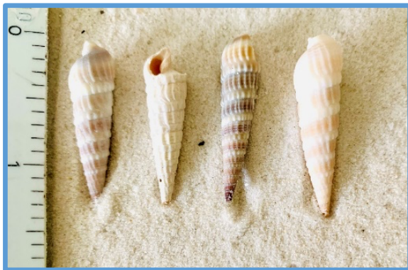
P - Auger