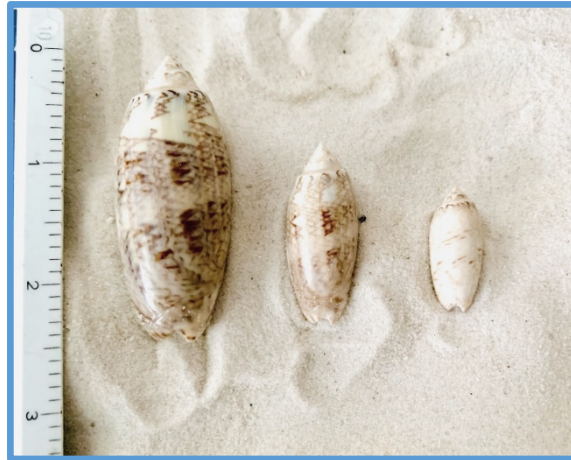
E - Olive