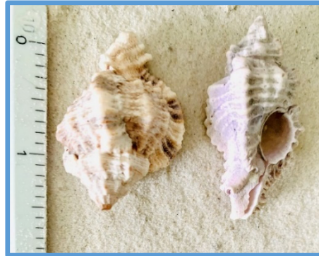
N - Murex