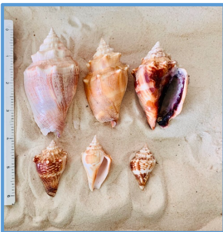
G - Conch