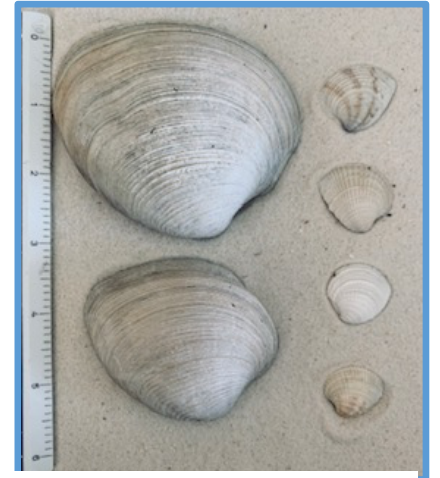
F - Clam