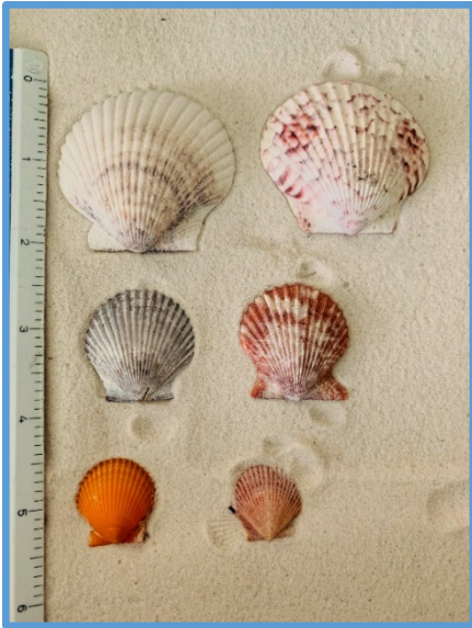
A - Scallop