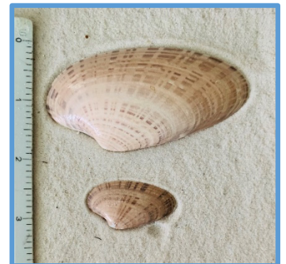
I - Sunray Venus