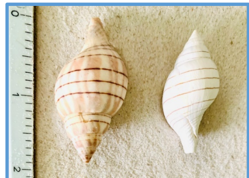
Q - Tulip